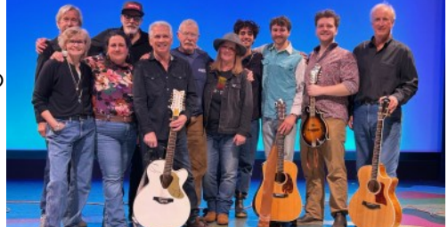
Collaboration with local radio station, WRGY which featured local musicians and community members for their fundraiser. March 2024

For 57 years the Rangeley Friends of the Arts has played a key role, along with other organizations, in creating a “sense of place” in Rangeley. The RFA provides the space and the opportunity for adults and youth to show and grow their artistic talents. For two generations, the RFA has provided support and encouragement for youth to think, feel and express themselves by allowing them to connect with others in unique ways. Each time they take a bow, they come up taller! Our primary focus: To transform the Lakeside movie theater into a welcoming, up-to-date Community Arts Center. Hundreds of volunteer hours by the board and friends have assisted this process. Inspiration and commitment by the Rangeley Friends of the Arts has changed the fabric of our community and created an enhanced sense of place for the Rangeley Lakes Region.