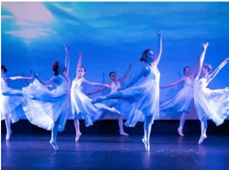
Lakeside Dance Academy students at the Spring Recital.

We provide subsidies for student lessons in dance and music and awarded three scholarships to a graduating seniors. We bring art into local classrooms and all K-12 students at RLRS as well as local home-schooled students benefit from the RFA's arts education initiatives.