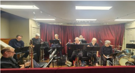
Volunteer pit singers with the band for "Newsies" August 2024