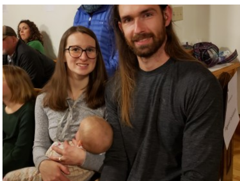
43rd annual Walk to Bethlehem Community pageant Joseph, Mary and Baby Jesus volunteers December 2024

207-864-5000 email: rangeleyarts@gmail.com