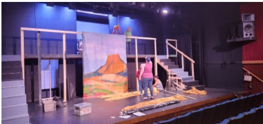
Volunteers erecting the set for Newsies July 2024