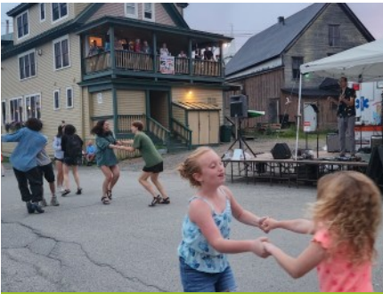
Dancing in the streets at the Haley Pond Park gazebo as part of our FREE annual Street Dance concert.