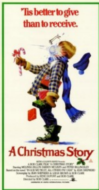
One of the Free movies presented to the public in 2024 in collaboration with Historic Rangeley.

Movies, Movies, Movies: In 2024 we showed 30 First-Run movies including 6 Indie Films to small but appreciative audiences.