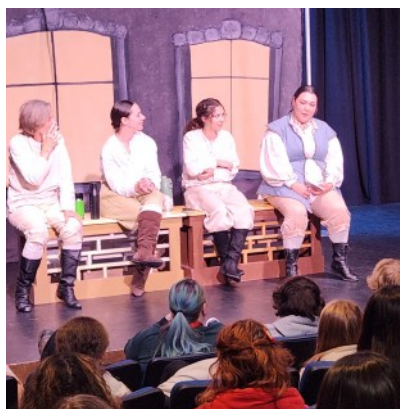
Q & A with the RLRS students after the Theater at Monmouth troupe performance of Shakespeare's Romeo & Juliet . November 2024