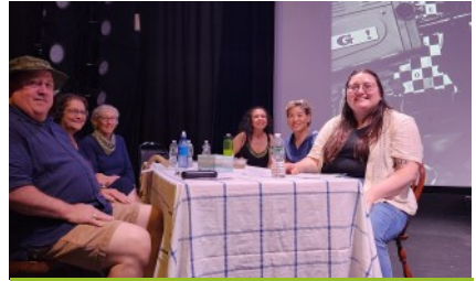
The Kitchen Table performance July 2024

In 2024, we produced four live-theater offerings . The RFA gave storytellers and tech people a platform when we presented "The Kitchen Table: An Evening of Personal Storytelling" in July and a new program in August. Actors, singers, directors, stage-managers, lighting and sound techs participated in performances of "Newsies" & DIVA .