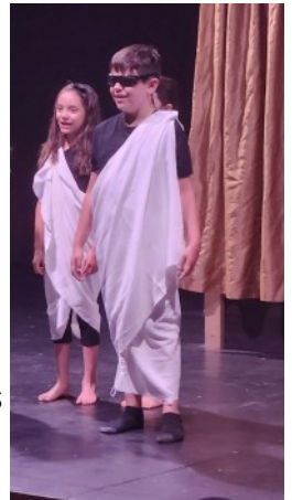
Campers at the Youth Drama Week finale.

The Arts matter: fostering talent, developing character, and building the audiences of tomorrow. Our Drama Camps were full in 2024. We had two weeks of youth camp with 25 campers and one week of teen camp with 11 campers. We offered our theater and flex room for community non-profits and civic groups for free such as, WRGY, RLRS, Baptist Church, National Honor Society/RLRS, The Lakeside Dance Academy, Highlands Overlook Homeowners Association meetings, and a Trail Town Festival event. We also offered several free community movies, including live streaming of NASA's eclipse coverage in April.