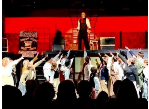
Local actors and community members in our July 2022 Production of Sweeney Todd

Thanks to a grant from the Morton Kelly Charitable Trust, the RFA also provides space for any local non-profit or civic group to use our auditorium and flex room space for free to show a film, host a speaker or have a fundraiser.