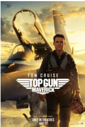
Many first-run movies that had been delayed were released in 2021

Movies, Movies, Movies: In 2022 we showed 34 First-Run movies and 6 Indie Films to small but appreciative audiences, all in a Covid-safe environment.