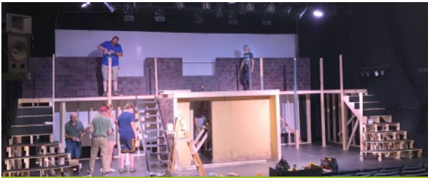
Volunteers erecting the two story set for Sweeney Todd July 2022

Community Theater can't happen without our COMMUNITY! If you would like to get involved with the next live theater event contact us at RANGELEYARTS@GMAIL.COM or visit RANGELEYARTS.ORG and click on the "Get Involved" tab.