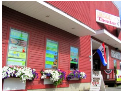
Our center-of-town, Main Street location: The RFA Lakeside Theater.