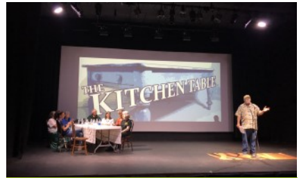
The Kitchen Table performance July 2022

In 2022, we produced two live-theater offerings. RFA gave storytellers and tech people a platform when we presented “The Kitchen Table: An Evening of Personal Storytelling”. It gave actors, directors, stage-managers, lighting and sound techs an outlet during four performances of “Sweeney Todd” & DIVA .