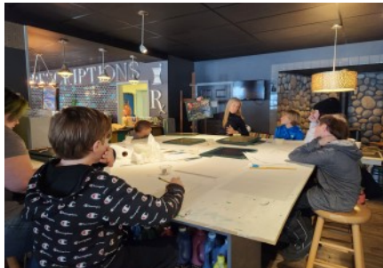
CASA students engaged in a creating art work for a community art display in support of International Dark Sky week.