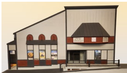
Model of the new facade

We plan to complete the renovation of the Theater in the fall of 2023. The façade of our building is sorely in need of renovation and we are still raising funds. You can contribute online via our web page.