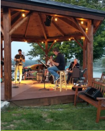
BandName? performed at the Haley Pond Park gazebo as part of our Outdoor

We continued our FREE outdoor concerts in 2022, so people could enjoy live music in a safe setting.