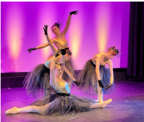
Lakeside Dance Academy students at the Spring Recital.

We collaborated with Sojo's Makers Space to offer a variety of art camps and workshops. We provide subsidies for student lessons in dance and music and an annual scholarship to a graduating senior. We bring art into local classrooms and CASA, our creative arts after-school program, continued whenever in-person school was in session. All K-12