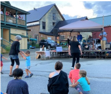
The RFA held the annual Street Dance on Pond Street in July

207-864-5000 email: rangeleyarts@gmail.com