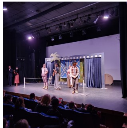
The RFA hosted the Theater at Monmouth troupe for a performance of Shakespeare's "As you Like it " for RLRs students