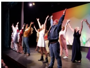
Annual Summer DIVA Show July 2022

Four committees are working on these goals and are responsible for developing strategic objectives and action plans.